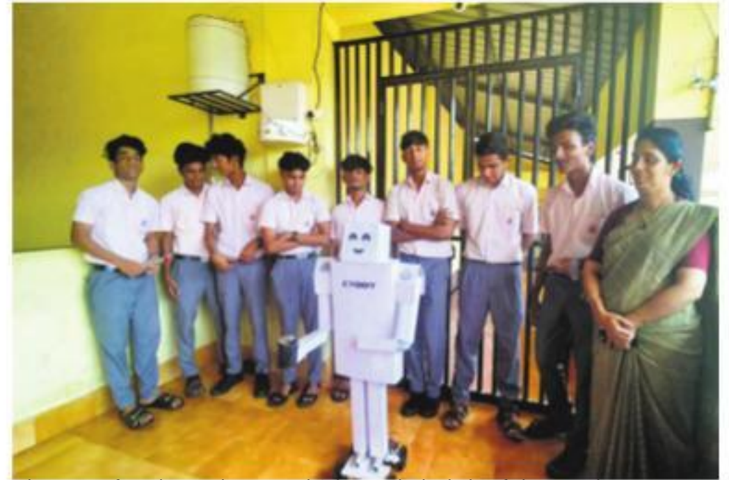
The team of students who created Cybot with the help of their teacher

The students used cardboard, paper and PVC pipe to build Cybot. The whole process took three weeks. The movements of the robot were controlled via a programme