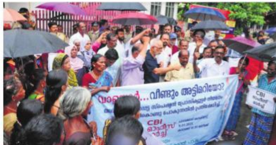
The march taken out by the activists of the Walayar Neethi Samara Samithi to the CBI office in Palakkad on Tuesday